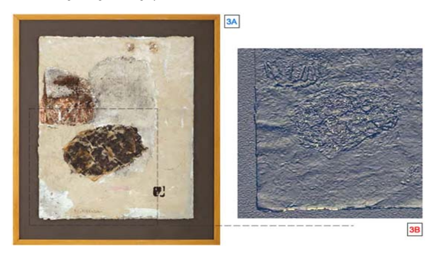
Fig. 3. Digital documentation by 3D Laser Scanning 3A - case study: Face without a face by Florica Prevenda (1998) / mixed media on paper / 65x50cm; 3B - maximum digitization of the surface was rendered impossible by the roughness and the relief of the surface under investigation as well as by the materials of which it consists (the resolution obtained reached millimeter size only); the central area of the work posed the greatest difficulties as the successive layers of superfine porous paper (tea sachets) attached to the area and covered with a fine layer of wax could not be scanned due to the transparency of wax at the laser scan's specific wave radiation (690 nm)