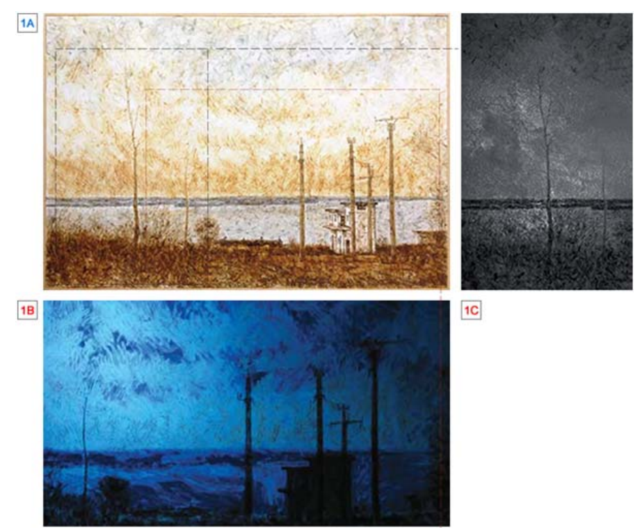
Fig. 1. Multispectral analysis: 1A - case study: Abandoned transformers on the Danube by Nicolae Comănescu (2009) / ash, soil, dust, mustard powder and acrylic medium on canvas (80x120 cm); 1B - 1C - details in UV fluorescence mode, near infrared region respective, revealing the working technology, successive color layers, possible retouchings/overlappings and optical characteristics of some of the materials used (fluorescence of the acrylic emulsion)