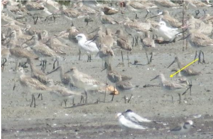
Fig. 2. Great Knot (yellow arrow) with other shorebirds standing on a mudflat on 21 December 2019 in the coastal zone of Banyuasin Peninsula, South Sumatra province, Indonesia

1988 range from 1 to 66 birds, with a record of 21 birds in April 1989. The Great Knot was absent from field surveys from 2001 to 2004, but it could be overlooked in the field, due to the similarity of the Great Knot and other shorebirds. This species could be overlooked in the field, due to the similarity to other shorebirds (Figs. 2 and 3), particularly with Red Knot Calidris canutus , because of similarities in their feeding action, flocking behavior and habitat choice, and because both are found in Indonesia and Australia [21, 22].