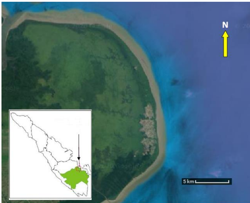
Fig. 1. Map of Banyuasin Peninsula, South Sumatra Province, Indonesia

Banyuasin Peninsula of South Sumatra Province in Indonesia is an important site for waterbirds [10]. This site was listed as an Important Bird Area (recently known as Key Biodiversity Area), Ramsar site, and important wetlands site in Indonesia [12-14]. Banyuasin Peninsula administratively is located in the Banyuasin II subdistrict, Banyuasin District, South Sumatra Province, Indonesia (Fig. 1). A total of 35 km line of coastal zone stretching from north to south in Banyuasin Peninsula. This coastal zone has provided mudflats that support important staging habitats for migratory shorebirds during the non-breeding period [15-17].