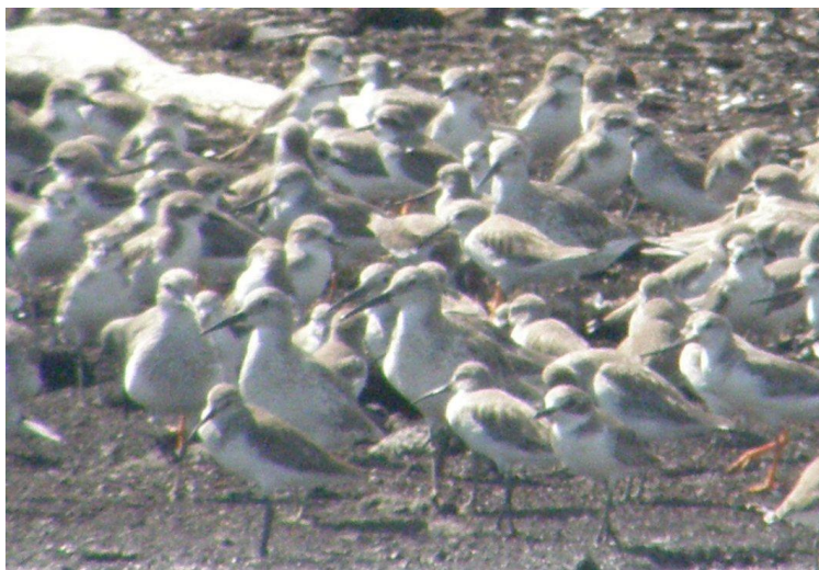
Fig. 3. A number of Great Knot with other shorebirds on a mudflat, 1 November 2008 in the coastal zone of Banyuasin Peninsula, South Sumatra province, Indonesia

The significant records of over 100 Great Knots in a count are recorded in November 2008 (c. 250 birds), November 2014 (300 birds), October 2020 (156 birds) and December 2020 (200 birds). The population trend of Great Knot is shown to be increasing (Fig. 4), based on the comparison in the number of Great Knots between periods 1984 to 1989 (six reports, maximum count 66 birds and average 31 birds), with the number in 2008 to 2021 (six reports, maximum