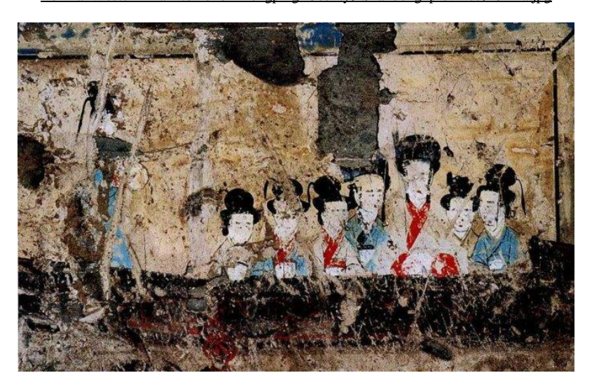
Fig. 2. Fresco of a Group of Women from a Han Dynasty Tomb in Sian, Shensi

Features of the techniques of performing wall paintings of the Han period were studied on the examples of tombs in the provinces of Henan, Shanxi, Shandong, Hebei. In the wall paintings of the Han period there was a combination of the actual plane paintings and relief. A study of Bu Qianqi's tomb, discovered in 1976 in Luoyang City, Henan Province, dating to about 86-49 BC, showed that the wall painting was composed of individual prefabricated elements Given the impossibility of painting the surface directly in the dark tomb, the technology of its implementation provided for such a stage. Twenty hollow brick slabs were prepared for the wall paintings on the ceiling, on which white primer was applied. Then on a white lime basis the drawing from brushes from fur of animals was put. Each element was