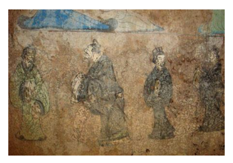
Fig. 1. Confucius and Lao-Tzu, fresco from a Western Han tomb of Dongping County, Shandong province