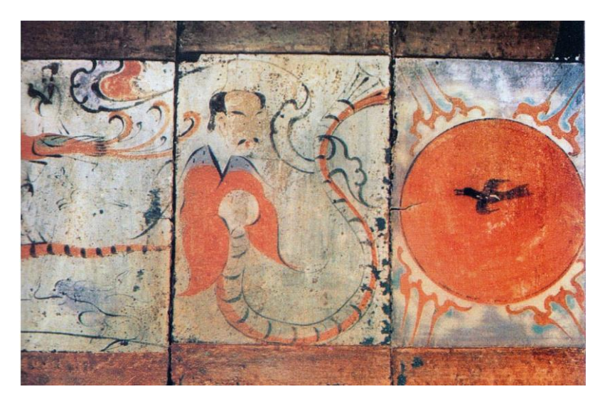
Fig. 3. Wall painting of a fragment with the image of a winged man-snake – a celestial deity and a crow against the background of the Sun in the tomb of Bu Qianqi

The final stage of the Han period mural painting, namely the Eastern Han period, was marked by the preservation of the traditional technology of making murals on stone slabs and hollow bricks.