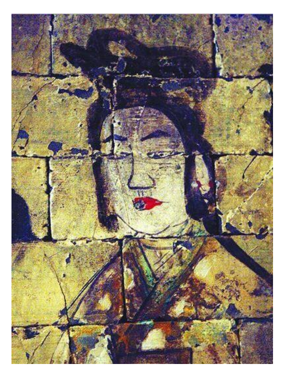
Fig. 4. Western Han Dynasty Woman, Han Tomb in Sian, Shaanxi.