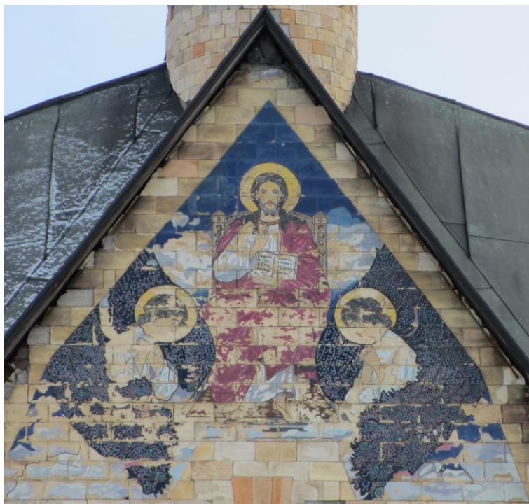
Fig. 6. Majolica panel on the memorial chapel western facade gable with the image of Christ and two angels

During the Soviet period, the chapel was not used for its intended purpose and was in a dilapidated condition at the beginning of the restoration in 1987. During the restoration of 1987–1989 (head of the research team, chief architect of the project – V. Trehubov) the copper roof and the original helmet-shaped top with a cross were restored.