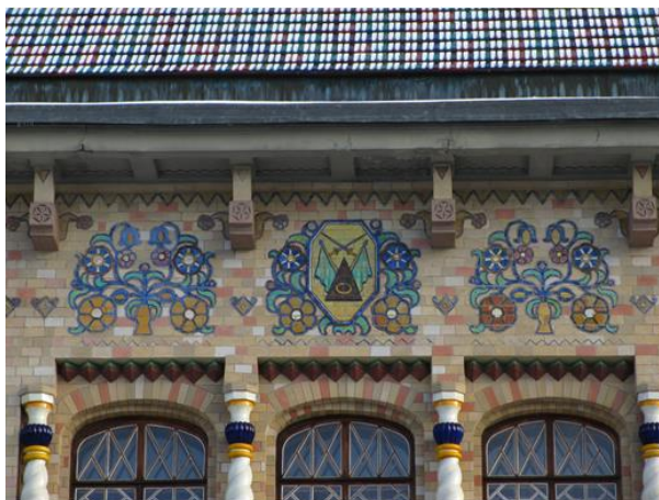
Fig. 5. The upper part of the building's central risalit with majolica panels depicting the "tree of life" and the coat of arms of Poltava province, the windows are flanked by decorative twisted columns

building, a true unity of interior and exterior, organic synthesis of painting, sculpture, arts and crafts and architecture, stylistic integrity of forms have achieved.