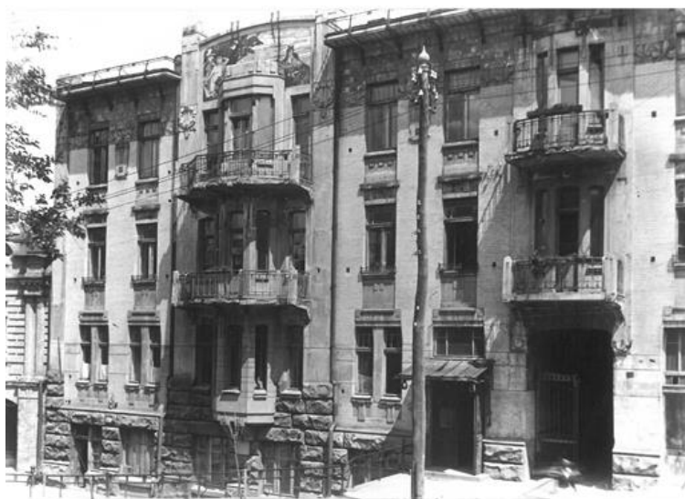
Fig. 4. Ceramic panel on the facade of the house on the street. Lutheran, 15

Several factors contributed to the rapid and effective spread of such "national-style" majolica: raw material resources, the purchase of European ceramics, the experience of Russian workers in production in Europe and its further implementation in Russian practice.