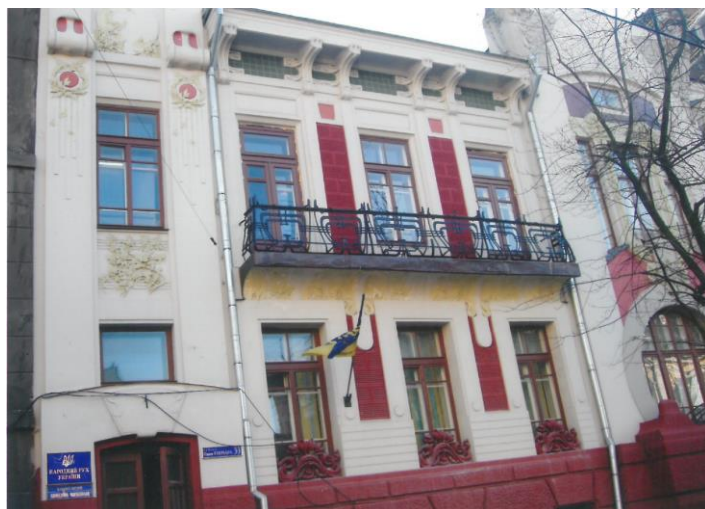
Fig. 8. Restored ceramic decor of cornice planes. Condition after restoration

under the crowning cornice, ceramic tiles with a rich green color ranging in size from 13 to 17.5 cm were used. As in many other buildings in Kyiv with ceramic facing, the ceramic strips of the former clinic facades were covered with a cement layer during the field inspections in 2002, so they needed to be cleaned. Ceramic inserts were successfully combined with a mosaic on the central a mosaic on the facade plane central protrusion of triangular bright yellow glasses, glued to a layer of plaster with animal glue (Fig. 8). At the time of the survey, both the ceramic inserts and the mosaic were in unsatisfactory condition, so along with the general set of restoration works, both ceramic tiles and mosaics were cleaned and supplemented at the places of loss.