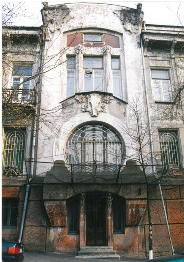
Fig. 2. A fragment of the main facade of the former Kachkovskyi Clinic at 33 Honchara Street with contamination of the eaves with ceramic facing by a layer of cement and the emergency condition of the stained glass insert of the central piers. Condition before restoration

The analysis of the distribution degree of mosaics and frescoes on the architectural monuments facades in Kyiv proves that in Art Nouveau they were also used very rarely and did not become particularly widespread, most often used sculpture, reliefs and bas-reliefs, and ceramics – in the form of monochromatic tiles strips on the Kachkovskyi Clinic building at 33 Honchara Street) (Fig. 2). Among the isolated examples is the majolica panel "Pan and Syringa" on the facade of the building at 15 Lutheran Street. On the facade of the building, one of the well-known paintings is reproduced in majolica – A. Böcklin's painting "Spring Evening" based on a Greek legend. The majolica panel was made by A. Kozlov in the Abramtsevo ceramic workshop.