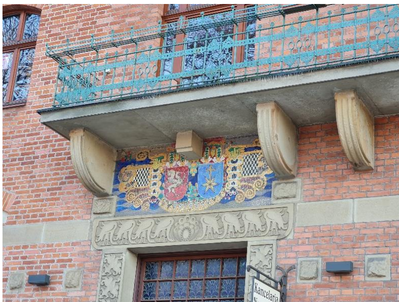
Fig. 10. A view of the mosaic on the front elevation of the Małachowski tenement house at 36 Piłsudskiego Street now

The issue of protecting the facade decoration of historic buildings, among which mosaics or bas-reliefs are of great importance, is of universal importance because there are many historic buildings around the world, the value of which is influenced, among others, by rich ornamentation of facades [36]. In Polish cities, such as Cracow, but also in others, many mosaics and bas-reliefs have survived to this day as unique finishing elements with above-average artistic craftsmanship [10].