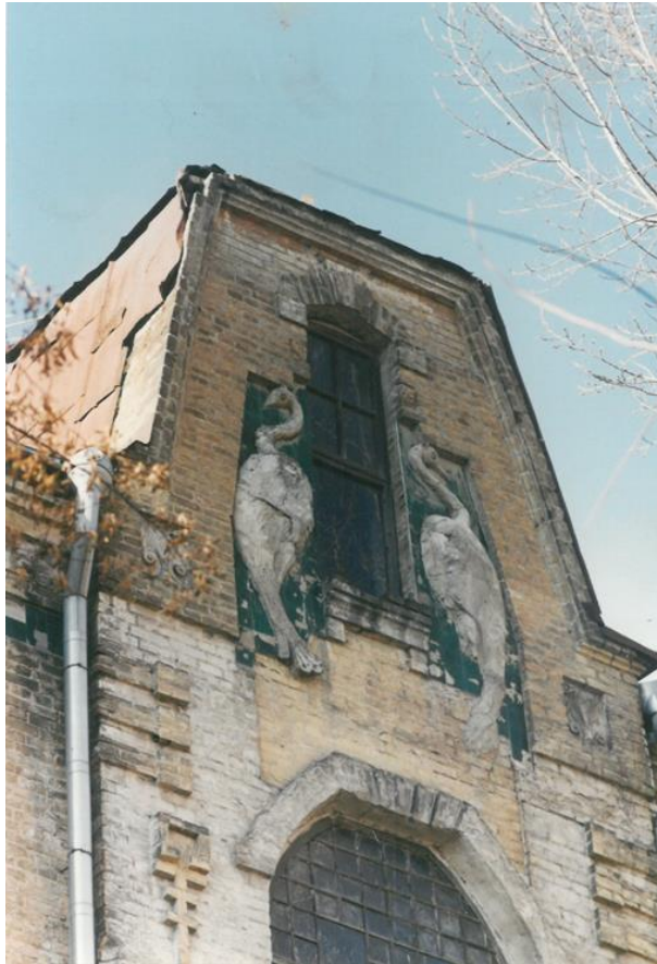
Fig. 3. Bas-relief images of two peacocks on a background of green glazed ceramic tiles on the tongs of the building at 81 Turgenevska Street

The most commonly used bands were burgundy, blue and green. The main problem is that over time, the ceramic facing crumbles, so in the case of non-professional repairs, it is simply knocked down or painted over. In general, in comparison with bas-reliefs and sculptures, majolica facades of Kyiv buildings were rarely lined, just as the practice of monumental frescoes was not introduced.