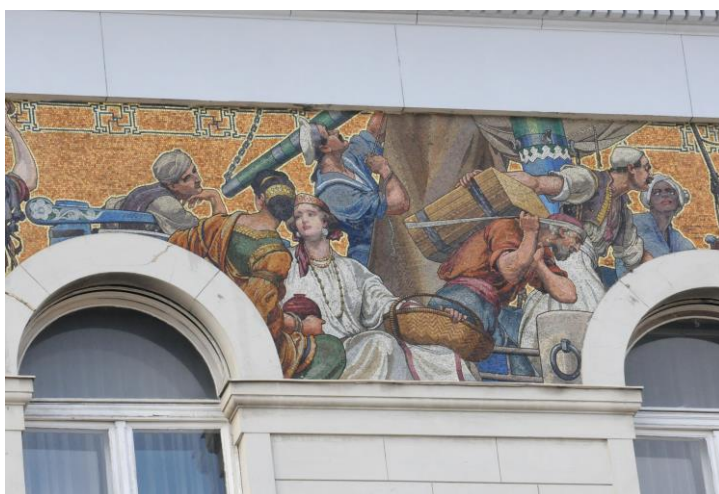
Fig. 13. Fragment of the mosaic

The composition has a figural and narrative character. The mosaic depicts twenty figures, most of whom are facing, or moving to the right towards the planned, central axis of the palace. Only the last three figures at the end of the frieze are facing the opposite, left side. This composition suggests movement from the left to the right and its culmination near the architectural axis of the complex. The male and female figures of various ages and poses are wearing colourful outfits (Fig. 13). The extreme left part of the composition comprises a group of five men with a horse-drawn carriage (a shaft bow characteristic for the Russian and Baltic coastal areas). The figures are wearing clothes characteristic for Central Asia. In the second part of the composition, there are female figures in traditional outfits with rich ornamental patterns. They have oriental features, but also those associated with southern Europe. This part of the composition is set against the background of a sailing ship with a moustached sailor at its mast. The central part of the composition is three males facing the others, as if receiving the transported agricultural commodities, including a bale of cotton. The group consists of two men in oriental clothes (one of them is dressed as a Circassian or a Don Cossack) and a man in western outfit standing between them (Fig. 14).