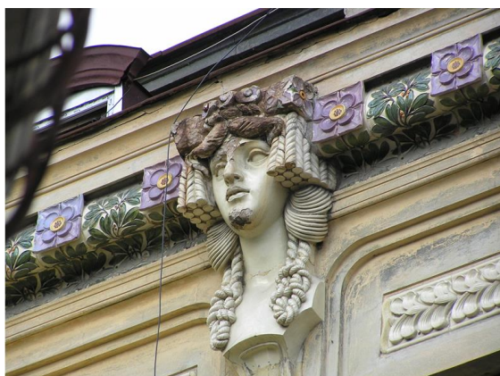
Fig. 1. Ceramic ornament on the facade of the building at 5 Morska Street in Yalta

In general, the cities of Ukraine were not characterized by the widespread use of complex ceramic ornaments and panels, with the exception of the objects of the so-called Ukrainian national romanticism. At the same time, for the cities of Western Ukraine, which was under the general influence of the Austro-Hungarian Secession, ceramics on facades are more typical, and ceramics with a certain pattern, for other territories it is less typical, although such examples were even in Crimea, where on the facade gypsum and majolica decor (Fig. 1).