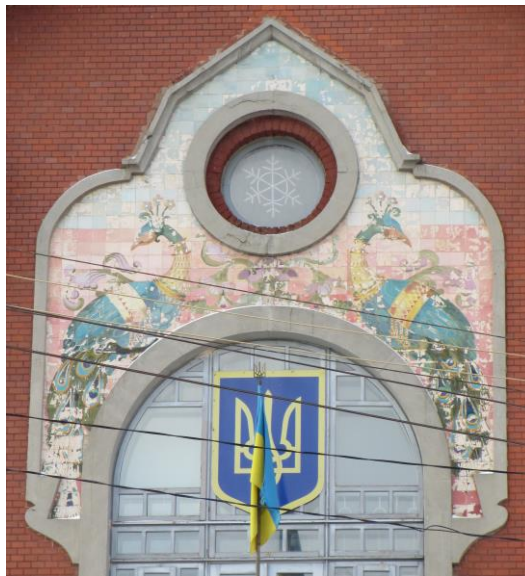
Fig. 7. Decorative majolica panel with the image of two pads above the main entrance to the building of the former Noble and Peasant Land Bank in Poltava

red ceramic tiles that mimicked brickwork, and a cut corner, where the main entrance was organized. The fairy-tale romantic modernized image of the bank building with wedge-shaped gables such as the kokoshnik, peacocks and sculptures of the fairy birds Sirin and Alkonost on the main facade, which is somewhat inappropriate for a serious banking institution, was not accidental. In a similar style with elements of Russian folk architecture, the buildings of this institution were erected in other cities (in particular, in Kyiv) in order to make them more understandable and attractive to the "common people". According to a number of researchers (Vaingort, Ignatkin and others), the construction of a neo-Russian-style bank building in Poltava was seen as a kind of response to the challenge posed to the Russian imperial ideology by the construction in 1903–1908 of the Poltava Provincial Zemstvo, the first administrative building in Ukraine, sustained in the national Ukrainian style. The decorative qualities of the building were ensured by the use of Poltava ceramics – red tiles and majolica panels depicting the coat of arms of Poltava province, which filled the planes of decorative gables of the two side facades, as well as a majolica panel placed on the pediment above the central entrance, which depicted peacocks (Fig. 7).