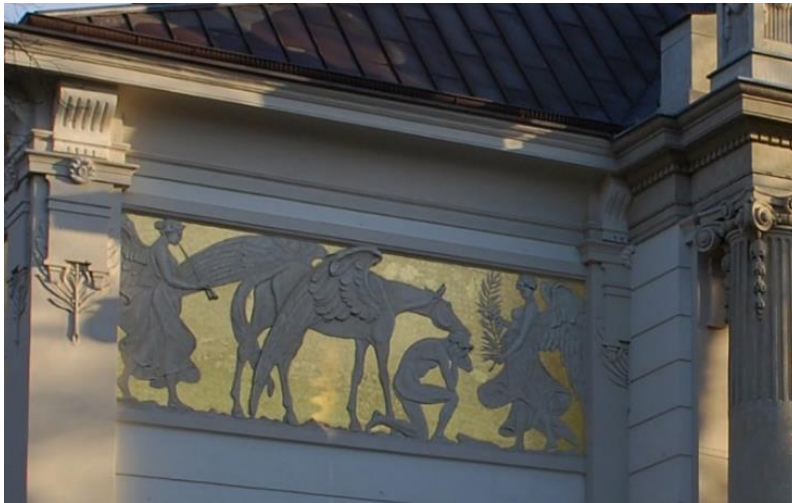
Fig. 11. The view of the frieze decorating the Palace of Arts today

mosaic, but for financial reasons this important element for the project was not made right away, and almost 100 years later. One of the main decorations of the frieze, which runs at the level of the windows of the second floor, were figural reliefs attached. The frieze has gaps in the form of windows, pilasters and niches with artist's busts. In terms of color, it also stands out against the building's facade. As mentioned above, the background of the frieze is covered with gold flakes, which were supposed to imitate a mosaic, and the relief figural representations located against it are white [13, 14].