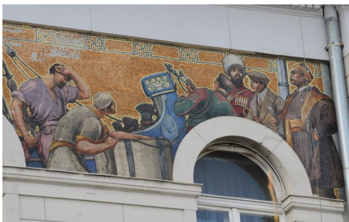
Fig. 14. Fragment of the mosaic