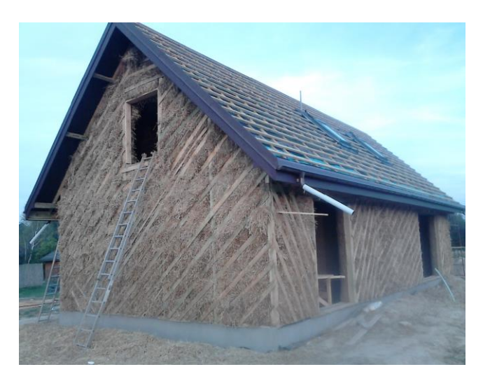
Fig. 1. Photo of a straw bale house during construction (Lublin area, Poland, 2017)

Grasses and straw have been used for building since the prehistoric times; however, the modern straw bale technology emerged in the early 20<sup>th</sup> century in Nebraska, USA, with the introduction of first machine-manufactured modular bales onto the market [2].