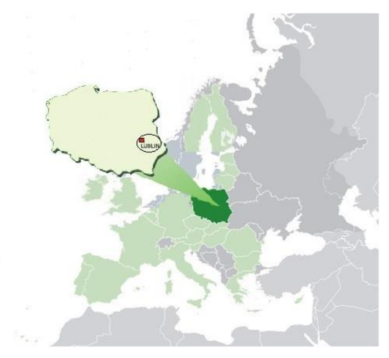
Fig. 2. Location of examined houses in Eastern part of Poland

The straw bale technology became popular in the rural area in the Lublin region – Eastern Poland about 15 years ago. Poland has problem with the outdoor air pollution in cities and some southern heavily populated areas, but Eastern part of Poland is less developed. Despite the main city in the area (Lublin), the land in the north and south are agriculture areas with some national parks (natural conservation area). It is selected for living by ecologically concerned people. Some of those people, despite living in a less polluted region, decided to live in natural buildings. Therefore, it was possible to select a few homes in the straw bale technology for the examination of the indoor air quality. The location of houses under investigation is presented on the map in Figure 2.