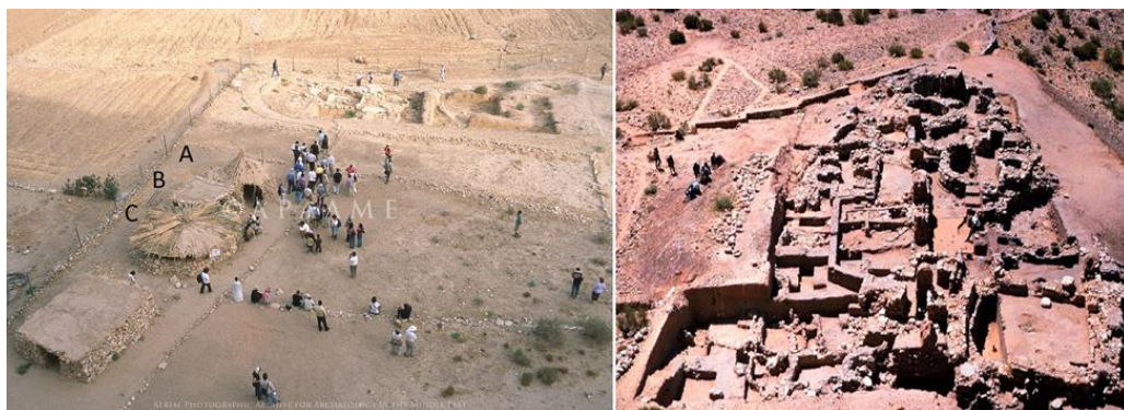
Fig. 2. General view showing the three styles of houses at Beidha

Beidha is a unique site in terms of the evolution of its architecture with a long continuous history of use. Archaeological research reveals evidence of a continuous architectural sequence ranging from clusters of round post houses, through individual sub-rectangular examples, and then ultimately true rectangular buildings (primarily corridor buildings) as shown in figure 2 [13].