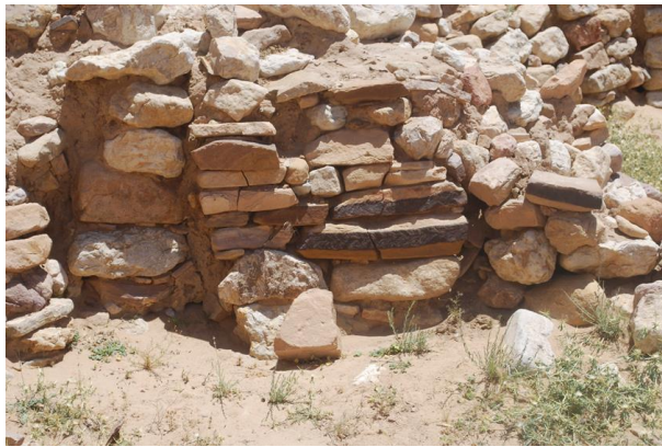
Fig. 6. Stone cracks due to excessive load

Cracking of some of the building stones, which are flat and with large surface area in comparison with thickness, could be attributed to excessive load as a result of the accumulation of deposits over the wall with the laps of time (Fig. 6). Other cause may be binding mortar weathering and fall of some small supporting gravel underneath the stone which creates an uneven distribution of load from the weight of stone above and directed over small areas of the stone surface.