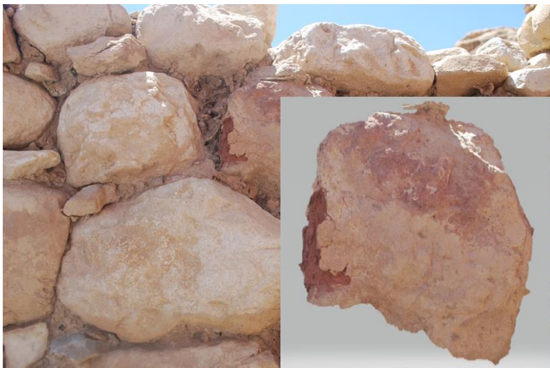
Fig. 5. Selective weathering of limestone blocks that contain high percentages of limonite

Unlike mortar, most stone blocks used in building Beidha structures are in good preservation condition indicated by their good mechanical strength. However, it has been observed that few examples of the stone blocks have been selectively deteriorated as manifested by their flaky surfaces and weakened structures. Laboratory analyses by XRD and ICP-OES prove that the basic difference between the deteriorated stone blocks and the preserved ones is their content of the iron oxide limonite - \text{FeO(OH)} \cdot n\text{H}_2\text{O} . The deteriorated stones contain a high percentage of 5.26% of limonite while the preserved ones contain as low as 0.78%. Limestone that contains high percentage of limonite is weaker, softer and has more porosity and less specific gravity when compared with limestone that contains no or low percentages of limonite [25]. This explains the selective weathering of these stones as shown in figure 5.