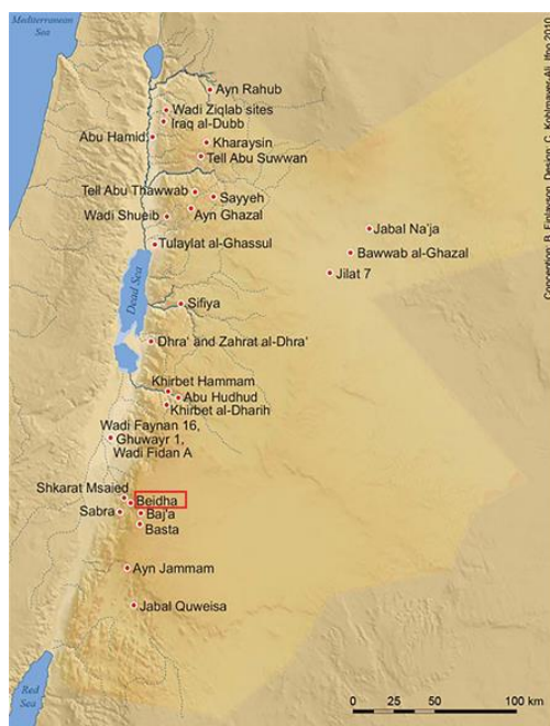
Fig. 1. Location of the archaeological site of Beidha in southern Jordan

Beidha is a major Neolithic archaeological site that is located within the boundaries of the famous world heritage site of Petra in southern Jordan (Figure 1). It is well known among archaeologists as a site that displays many of the most important attributes of settled village life at a very early time. Among these attributes is the use of masonry architecture. Diana Kirkbride excavated Beidha in the late 50s and early 60s, with a final field season in 1983. Her findings at the site have been used to define the cultural period known as the Pre-Pottery Neolithic B [7-10].