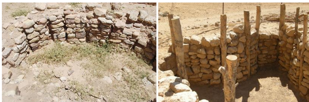
Fig. 11. Re-installing wood posts in the gaps

Wood posts should be reinstalled at their original locations, to protect the structures from further damage and stone failings. Wood posts were used as a construction material in Beidha structures to transfer the load of the walls horizontally and distribute the force over the whole height of the wall, which helps in preventing collapse. The complete deterioration of the wood posts created gaps between the wall's stones and imbalanced distribution of the force that caused a concentration of force over some stones. This resulted in stone cracking and falling as shown in the Figure 11.