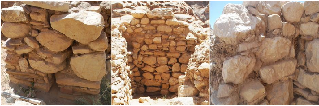
Fig. 4. Decay and loss of mortar lead to weakened structures

Mortar weathering has been caused by many natural agents particularly running water and persistent dampness as earth mortar is vulnerable to water damage. High levels of moisture gradually destroy the clay matrix, leading to increasingly friable mortar, a loss of structural integrity and ultimately the deformation of masonry elevations. Other factors such as soluble salts, wind, plant growth effect and daily cycles of fluctuation in temperature and relative humidity which caused change in volume and dimensions of the mortar have contributed to the acceleration of the weathering process.