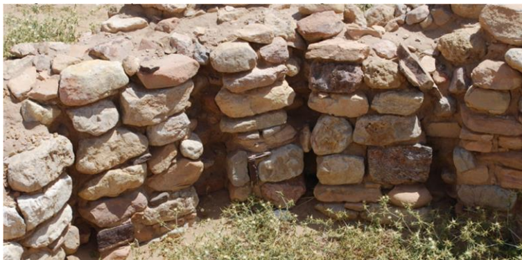
Fig. 3. Remains of one of the houses showing stones, remains of the mortar and the gaps resulted from the loss of the wooden posts

The field survey and laboratory analyses show that the structures of Beidha were built using local materials. Undressed limestone and earth mortars were the basic building materials used in the construction of the houses and the city wall. Thin layer of lime plaster was used to cover some internal walls and floors and tree trunks (Oak, Juniper) were used as posts to carry the roofs which were made of reeds covered with mud. Currently the only remaining building materials are the stones, remains of the binding mortar of the walls and some scattered patches of the floor plaster. Stones have survived and are in good preservation conditions while the mortar suffered severe deterioration and disintegration and wood posts were completely decomposed as indicated by the cavities left behind as shown in figure 3.