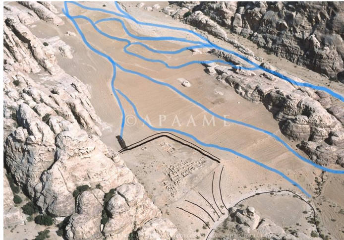
Fig. 8. Proposed water diversion channels

Based on understanding of the hydrology of the area, the best solution for this problem is the diversion of the runoff water away from the site. This can be achieved by constructing channels mainly alongside the mountain to divert water to the lower area outside the site, as represented in figure 8.