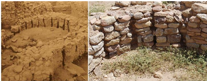
Fig. 7. Gaps between stones as a result of wooden posts deterioration

Wood posts were set up during the beginning of constructing of Beidha houses. They were used to transfer the load of the walls horizontally and distribute the force between stones. Wood is an organic material that is very susceptible to biological and physical deterioration caused mainly by fluctuations of humidity and temperature [26]. All wooden posts were totally lost leaving gaps between wall stones. This resulted in imbalanced distribution of the force and concentration of force over some stones which caused them to crack and fall apart as shown in figure 7.