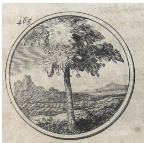
Fig. 2. Snippet from the book « Symbola et emblemata selecta », Amsterdam, 1705 . This publication inspired Skovoroda to his philosophical reflections on the magical image of the Apple Tree.

H. Skovoroda presented a whole theory of emblems in his works, moreover, he often accompanied his manuscripts with emblematic drawings and short descriptions or «mottos», which contained the philosopher's most beloved ethical thoughts. For a traveling philosopher, the relation to the world was formed by understanding the man's essence, and it was the thinker's symbolism which was brought up in the bosom of Ukrainian nature. While traveling, H. Skovoroda preached his ideas among the common folk, and his philosophical and aesthetic views were closely linked with the spiritual traditions of Ukrainian life, found understanding and spread both in the region and far beyond, influencing the development of the spiritual culture of Sloboda Ukraine, which could not but be reflected in iconography.