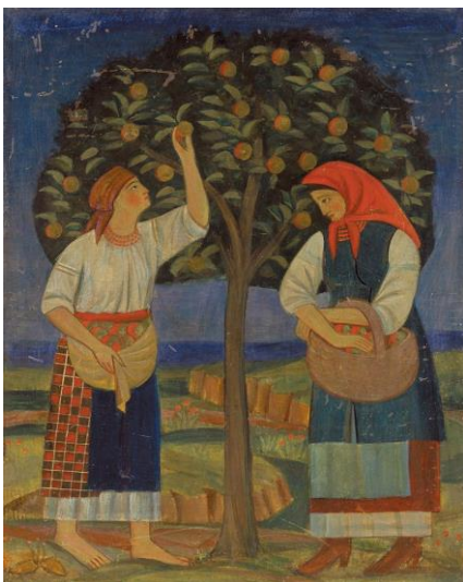
Fig. 3. T. L. Boychuk "In the Apple Tree", 1920, cardboard, temper, National Art Museum of Ukraine, Kyiv.