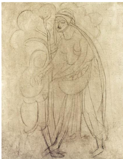
Fig. 5. M. L. Boychuk "Near the Apple Tree", 1912, graphite pencil, cardboard, National Art Museum of Ukraine, Kyiv

The modified figurative symbols of H. Skovoroda in the works of Ukrainian artists, first of all, the boychukists, reflected the idea of the Ukrainian Sacrum'y, the mythological conceptual scheme of the World Tree, when this symbol acts in the ethnoarchitectonic origins and the visual "visual" scheme: the upper, mountain world: sky, sun, moon, dawns, birds; medium earth world: hut, heart, soul; the lower, and beyond, world: gate, serpent, etc., which testifies to the identity with the national-religious outlook following collective and national memory.