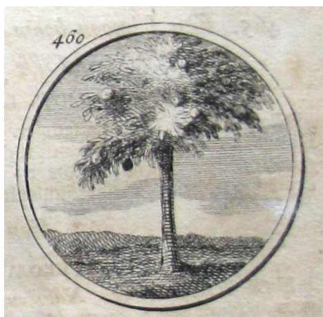
Fig. 1. Snippet from the book « Symbola et emblemata selecta », Amsterdam, 1705 . This publication inspired G. Skovoroda on his philosophical thoughts about the magical image of the Apple Tree.

Thus, in his works, H. Skovoroda linked the microcosm of a man with the macrocosm of society through the world of symbols, as mentioned in such works as "Narkis", "Melody", and others. According to the philosophical teachings of H. Skovoroda "about the symbolic secrecy world", the indivisible "visible" and "invisible" nature transforms it into a special plexus of "figures" and "symbols" [5]. H. Skovoroda taught students to "get into the depths of the image-symbol, to realize its inner, hidden essence" [6] (Figs. 1 and 2).