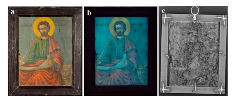
Fig. 4. the defference images of the wood painted showing the large insect tunnels and holes in wooden panel of icon: a) visible; b) UV luminescence; c) Radiographic image

These imaging techniques showed deterioration phenomena in wooden panel (Fig. 4.). The large insect tunnels run down through the wooden panel and holes extended in a vertical position to include the wooden panel and all painted layers. In addition to some areas of panel and painted layer had broken especially in edges of the icon. So, we must make of partial detachment and transferring of panel painting on to a new alternative support.