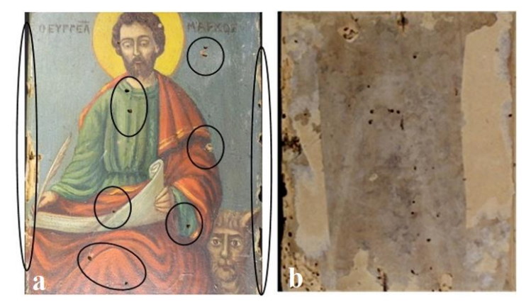
Fig. 2. Conservation state of the wood painted icon: a) front showing holes, missing parts in edges of panel and looses in painted layer, b) back showing holes, missing parts in edges of panel and remains of brittleness of the paper