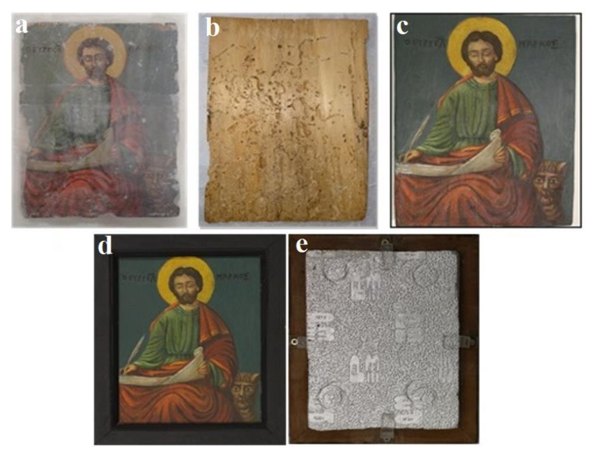
Fig. 6. Conservation procedures for "Saint Mark" icon: a) Facing painted layer; b) The painted icon after partial detachment of wood panel; c) After fixed the painted icon to the new suggest alternative support and retouched the painted layer; d and e) Front and back of icon after conservation

Before the partial detachment and transferring of panel painting carried out, we applied some procedures to reinforce the painted layer. Two further complete layers (Japanese tissue paper) of facing were applied over the whole painted surface with a solution of 5% Beva 371 in white spirit (Fig. 6a) [27].