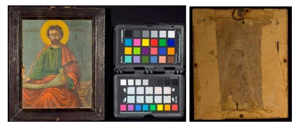
Fig. 1. "Saint Mark" Icon (front and back)

suffered various types of degradation and deterioration. The panel had split, large insect tunnels run down through all icon and holes extended in the vertical position to include all painted layers. In addition to some areas of panel and painted layer had broken especially in edges of an icon (Fig. 2). Also, there are remains of the brittleness of the paper on the back of the wooden icon. These forms of deterioration could have serious consequences on the stability of the wooden painted icon.