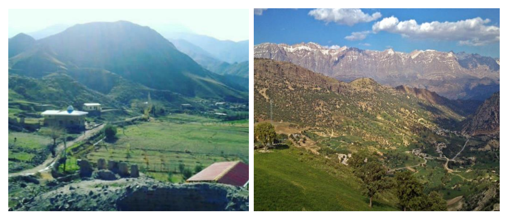
Fig. 2. Landscape of Dashte Raz region