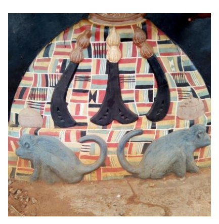
Fig. 2. The Pictorial Representation of the Tano Akora Deity guarded by Baboons