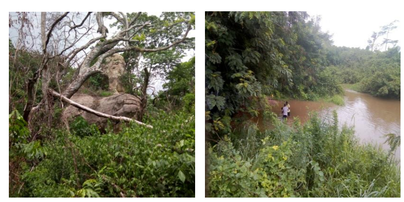
Fig. 3. Tanoboase Sacred Grove (a) and river (b)