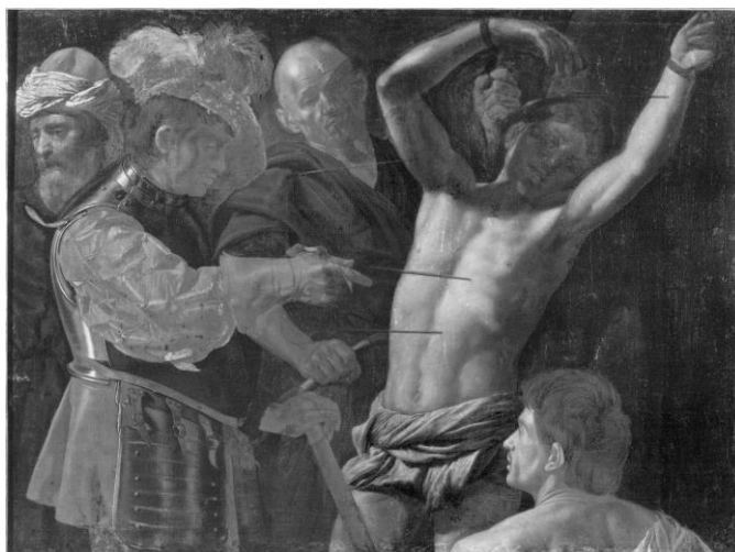
Fig. 3. Martyrdom of Saint Sebastian : Infrared Reflectography

In infrared reflectography (Fig. 4) we can see traces of a drawing made with a brush and dark paint. During the work, the artist made corrections to the composition, including, most importantly, changing the theme of the painting. The body of Saint Sebastian was painted in a different way than the rest of the painting. In many places the texture and the brush work do not match the form of the figure.