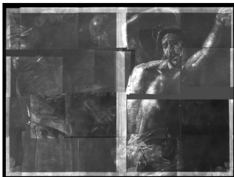
Fig. 2. Martyrdom of Saint Sebastian : X-ray Radiograph