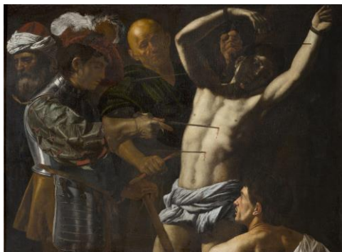
Fig. 1. Martyrdom of Saint Sebastian : Visible image