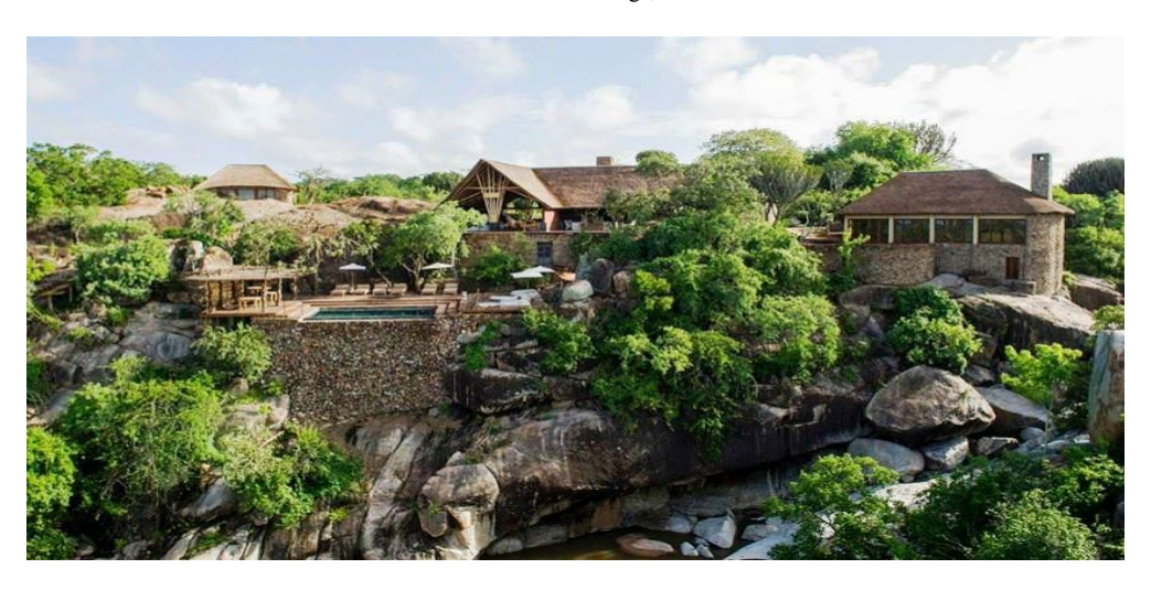
Fig. 4. Mwiba Tented Camp within Makao Open Area