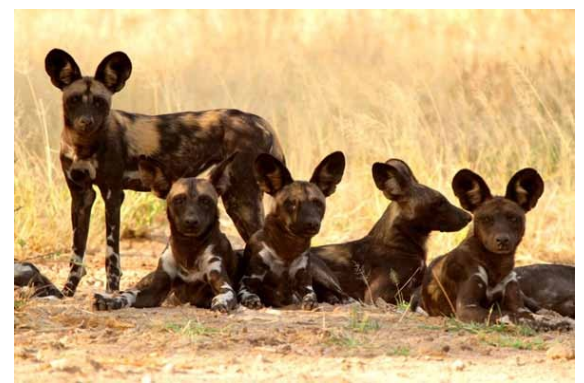
Fig. 3. A pack of African Hunting Dogs within Mwiba Wildlife Ranch

The presence of Mwilba Wildlife Ranch brings a potential role in protecting several threatened wildlife species. African Wild Dog Lyacon pictus which are regularly observed within the area are classified as endangered. African elephant Loxodonta Africana , Cheetah Acinonyx jubatus and Lion Panthera leo commonly occur within the ranch (Fig. 3 and Table 1).