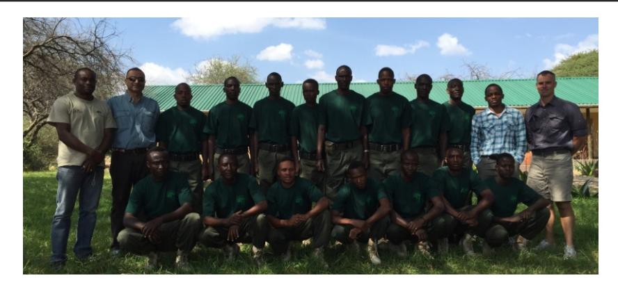
Fig. 6. FCF Wildlife ranger together with FCF officials