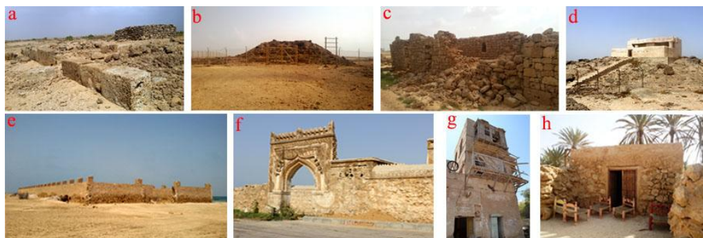
Fig. 4. Photographs showing the studied cultural heritage sites (a) El- Ghareen site, (b) Luqman mountain, (c) El Arady buildings, (d) Ottoman castle, (e) German House, (f) Hussein Al-Rifai House, (g) Abdullah Al-Rifai house, (h) one of Kessar's heritage houses

In addition, the Farasan Islands contain a number of military buildings represented in The Ottoman citadel that dates back to the period of Ottoman rule, and The German house that was established in 1901 to be a repository for coal used as fuel for vessels crossing the Red Sea.