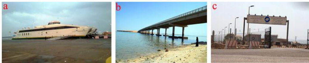
Fig. 7. Farasan ferry (a), the bridge connecting Farasan with Al-Sakeed (b), Farasan Saline Water Desalination Plant (c)

There is also a general hospital in Farasan and a number of mosques, gardens and green areas. It is noted that most of the main structure services are focused mainly on the Farasan Island.