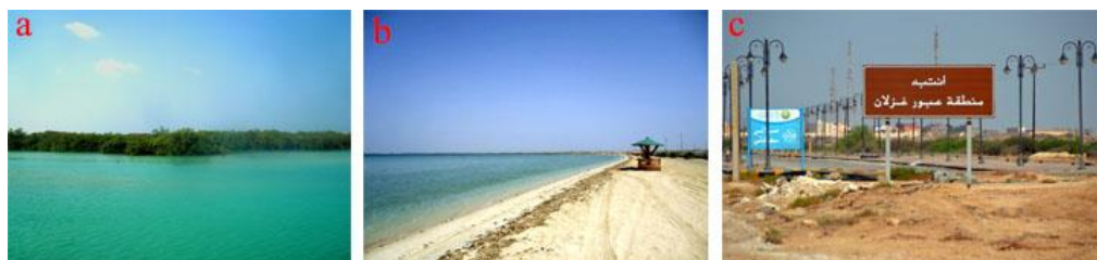
Fig. 3. Qandil Forest on Farasan Island, Coast of Hassis, the deer reserve

▪ Cultural Heritage sites: The Farasan Islands have many archaeological and historical elements (Fig. 4) which include a number of sites that contain some of the Stone Age artefacts. Some sites also feature the spread of pottery fragments on their surfaces, as well as other sites containing foundations of various buildings. An example of this is Al-Qurayyat, Al-Gharain, Al-Kadmi (in the village of Al-Kessar), Luqman mountain, Al-Baqr mountain, Muharraq, Wadi Matar and the village of Sayr.