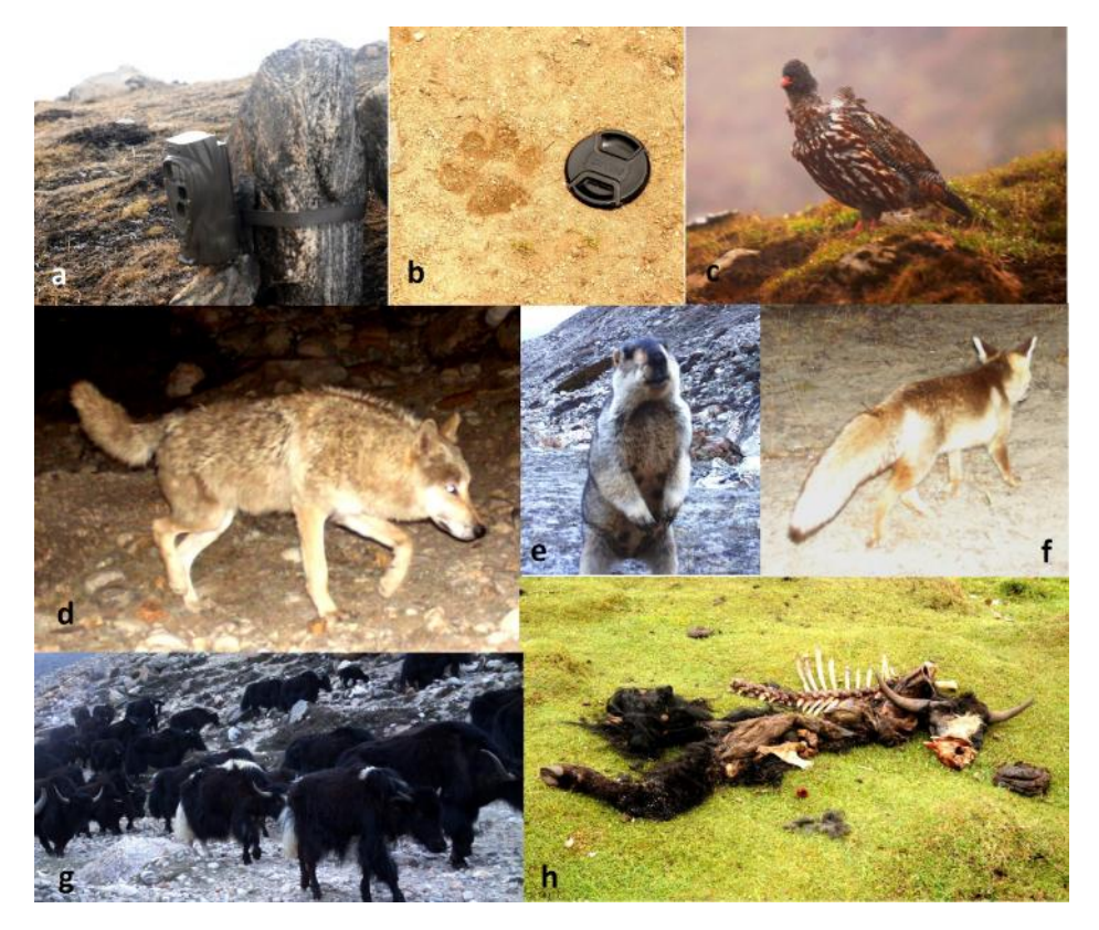
Fig. 2. Images taken with the studied fauna: a - Camera trap deployment, b - snow leopard pugmark, c - sighting of snow partridge, d-f - camera trap photos of Tibetan wolf, Himalayan marmot and red fox, g - livestock grazing recorded in camera traps, and h - livestock depredation by Tibetan wolf

effort. Both encounter rates and photo-capture rates were used as indices of animal abundance. Information on distance walked during trail sampling, GPS location, elevation, slope, and aspect were recorded corresponding to each location of animal presence and camera deployment. In addition, information was collected on livestock depredation by carnivores through spot checks of kills and informal interviews with the Tibetan nomadic Dokpa and Bhutia yak herders.