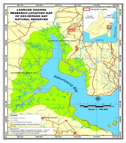
Fig. 1. Research Location Map

The research was conducted for six months from April to September 2013. Data collected consist of primary and secondary data and analyzed with analysis approachment of Analytical Hierarchy Process (AHP) with the number of questionnaires was 30. Through the hierarchy, a complex and unstructured problems can be broken down into groups which are then organized into a hierarchical form. Location of the study can be seen in Figure 1. Analitycal Hierarchy Process (AHP) is a functional hierarchy with the main inputs is human perception (Fig. 2).