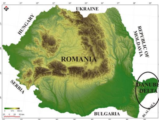
Fig. 1. Geographic location of the Danube Delta on the Romanian territory

The Danube Delta is situated in the north-western sector of the Black sea basin, in a mobile region of the terrestrial crust (the Predobrudjan Depression). Its limits are: 44°46'00" N lat. (Periteasca), 45°30'00" N lat. (South of Sasik Lake), 28°40'24" E long. (Ceatal Chilia), 29°40'50" E long. (East of the Chilia secondary delta) (Fig. 1). As for its surface of 5,600 km 2 , the Danube Delta, together with the flood-plain sector between Ceatalul Ismail and Galati city, represent the most important terminal plain of any European river (except the Volga and Kuban deltas on the territory of C.S.I.). The Ukrainian part, about one-fifth of the Delta area, covers 125,000 ha, of which 75,000 ha of land and 50,000 ha of water [2-18].