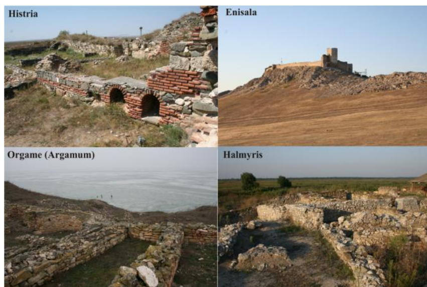
Fig. 3. The best known cities in the Danube Delta Reserve area: Histria, Enisala, Orgame (Argamum) and Halmyris