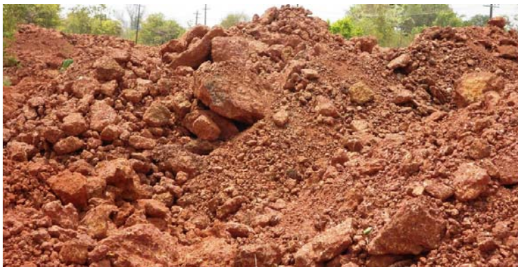
Fig. 3. The photograph showing dumping site of mined lateritic bodies.