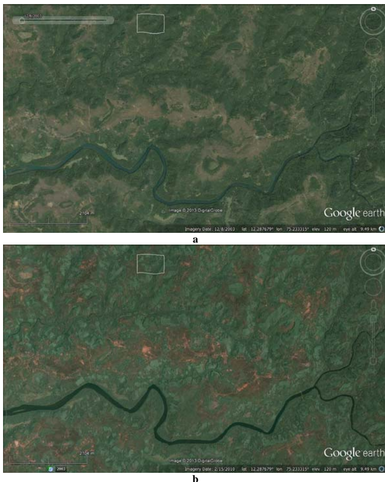
Fig. 4. The satellite image of the study area: a - taken in 2003, b - taken in 2010.