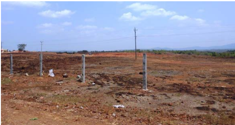
Fig. 2. The photograph showing alumina rich laterite terrain in the Kinanur-Karinthalam transect. The laterite mining area can be seen in the distance.

The alumina rich laterite of Karindalam area (Figs. 2 and 3) is being used as raw materials for the Cement Industries.