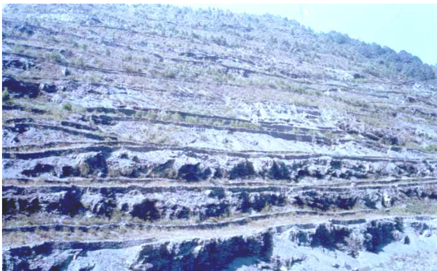
Fig. 2. General view of degraded limestone mine (Lambidhar)

Study area (Lambidhar) is entirely built on pure limestone and in krol belt (Fig. 2). Limestone is present in various forms such as dolomite, argillaceous-limestone etc. The climate of an area is rigorous dry for most part of the year. The year is broadly divided into three seasons viz., summer (April to mid June), rainy (mid June to mid September) and winter (November to March). Study site was divided into four different experimental sites according to their age as: Site I- Eleven years old rehabilitated plot; Site II- Eight years old rehabilitated plot; Site III- Six years old rehabilitated plot; Site IV- Four years old rehabilitated plot.