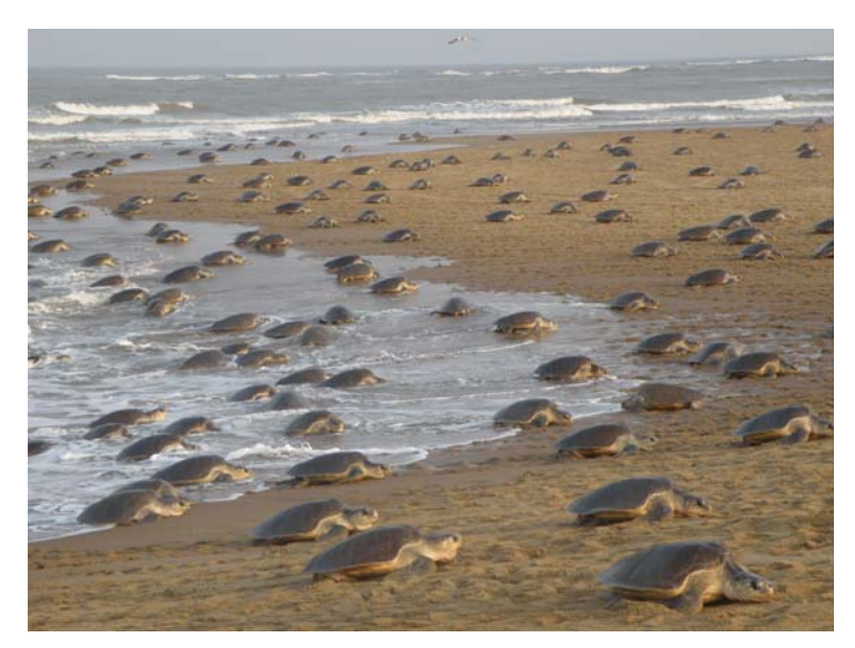
Fig. 1. Olive ridley sea turtles on beach

Gahirmatha. Although the nesting figures for different years from this rookery is subjected to critical review, this rookery claimed to be the largest for olive ridley turtles in its distributional range [3, 8 - 10]. Multiple mass nesting events (called arribada in Spanish) have been reported at Gahirmatha during some years while there are records of failure as well [3, 11, 12]. The estimate of mass nesting by Wildlife Wing of Odisha Forest Department at Gahirmatha have ranged between 1,00,000 to 8,00,000 in different years [11]. Before 1989, mass nesting occurred on a 10 km mainland beach near the river confluence, which subsequently got fragmented into smaller islands by 1999. Now, mass nesting is restricted to smaller islands, each less than one km in length. These sandbars are most unstable and dynamic and the topography and geomorphology of the beach changes with the prevailing current pattern and wind condition at the rookery. This study has made an attempt focusing on the changes in geomorphology and response of the olive ridley turtles for nesting along the arribada site. Although the data are only for three years, but it clearly shows an indication by the olive ridleys responding to the changes in the beach profile at Gahirmatha rookery.