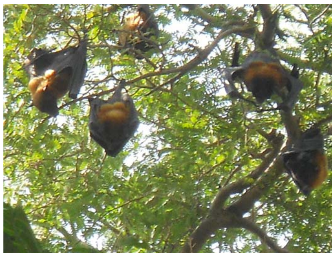
Fig. 3. A colony of Pteropus giganteus giganteus roosting on Vilayati Imly in Jasol

Jasol is twenty kilometer far away from Balotra city. It is a new site of Fruit bat, Pteropus giganteus giganteus roosting on the tree Neem ( Azadiracta Indica ) and Vilayati Imly ( Pithecelobium dulce ). The maximum number i.e 450 was recorded in the month of December 2011.