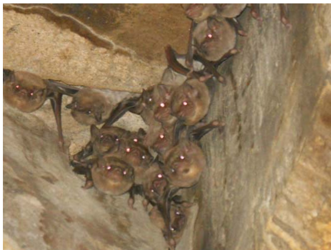
Fig.4. A Colony of Taphozous perforates and Taphozous melanopogon roosting on the ceiling of Kiradu temple.