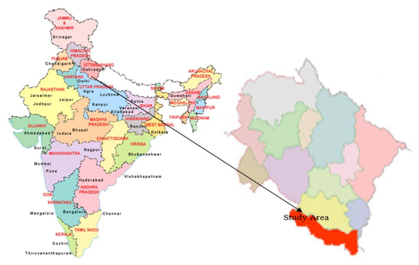
Fig. 1. Map of India and the study area (Udham S. Nagar District)

monthly maximum temperature ranged from 16.7\pm2.26^{\circ} C to 38.0\pm0.70^{\circ} C and minimum temperature was in the range of 8.2\pm1.20 to 23.4\pm0.98^{\circ} C (Table. 1).