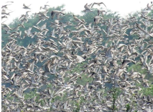
Fig 2. Mix flocks of Asian Dowitcher and Godwits on 13 November 2018 in Banyuasin peninsula, South Sumatra province, Indonesia

In North Sumatra, it was reported a total of Asian Dowitchers (6,970 birds at Sejara beach, and 987 birds at Tiram bay) on 28 March 2002; but it was only 160 birds reported at Asahan river on 25 September 2005 [28]. In addition, a survey during seven months (October 2014–April 2015) observation in Percut, North Sumatra, recorded total 321 birds. Based on this observation, number of Asian Dowitchers in North Sumatra look like a decline from 1987 to 6,970 birds in 2002, to 160 birds in 2005 and 321 birds in October 2014–April 2015. Another observation is from Asian Dowitcher east coast along Deli Serdang during 1995 to 2005 that the largest number reported 2,370 birds in 2002 [29]. Asian Dowitcher trend show similar declining pattern in Banyuasin peninsula, with the largest number recorded c. 6,970 birds in 2002, but the number in one single survey had never been recorded to 2,500 birds after 2002. However, due to the similar characters with the Godwits and usually mix of these taxa in flocks (Fig. 2 and 3), it is estimated that the number of Asian Dowitcher in Banyuasin peninsula could be still a maximum number of 5,000 birds.