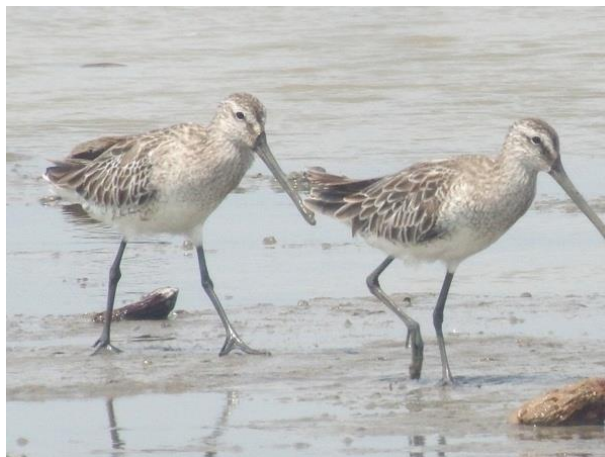
Fig. 3. Two Asian Dowitchers on 22 December 2019 in Banyuasin Peninsula, South Sumatra province, Indonesia