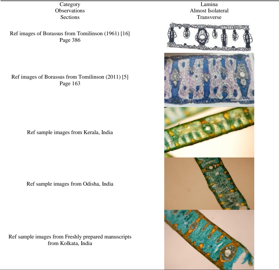
Table. 2. Thin sections of samples from Kerala and Orissa, India [15] and reference image from the herbarium of Vienna University

On the other hand, the samples from Tamil Nadu examined under PLM had a transversal stained section which was found dorsi-ventral in nature. The cross-section showed one-sided orientation. Hence it has been concluded that this specimen belongs to the genus Corypha (Table 3).