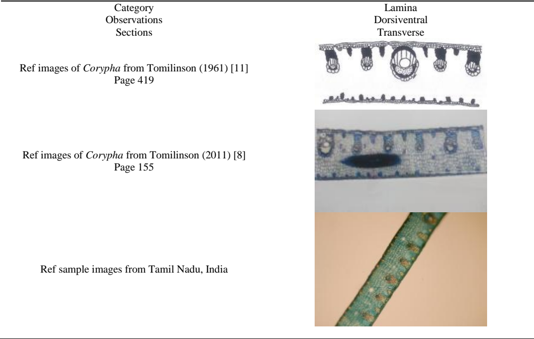
Table. 3. Thin sections of samples from Tamil Nadu, India [10]

On the other hand, under Polarised Light Microscope it has been found that few fibres were broken from few areas. The possibility of broken edges on the leaf probably may be due to the usage of iron stylus for writing. As mentioned earlier iron stylus has been used as one of the medium for writing. As the palm leaf has been etched during writing there is a great possibility that layer beneath gets affected and fibres slowly loosened. Therefore, this practice of writing somewhere affects the strength of the medium of writing.