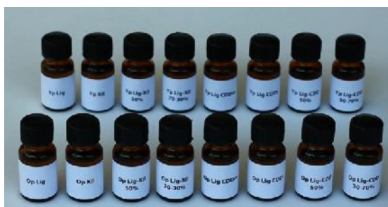
Fig. 2. Vials with different solutions in which the samples are immersed

The extraction tests involved the immersion of the samples in a vial with 7mL of each solution which was then placed in a hot water bath at 60°C for 30 minutes (Fig. 2).