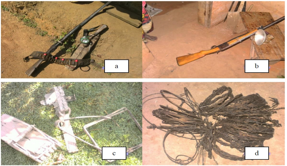
Fig. 3. Bushmeat harvesting tool used in the TMFC *a. Locally made gun, cartridge belt, cutlass and torch; *b. Hunting gun and flashlight (miner light); *c. Metal and mouse traps; *d. Wire snares prepared for setting in the field