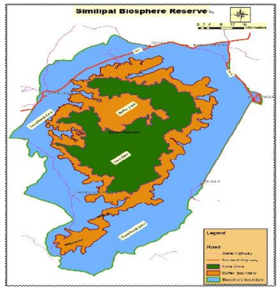
Fig. 1. Map of the study area

The study was conducted in the south-eastern transitional zone of Simlipal Biosphere Reserve [SBR] (Fig. 1) located in the Mayurbhanj district of Odisha state. It is in the eastern end of the Eastern Ghats and classified in the Chotanagpur biotic province of Mahanadian biogeographical region. In terms of biotic composition, Simlipal forests represent a link between the foot hills of Himalayas and the Eastern Ghats, as indicated from the biodiversity study. The herpetofauna of SBR comprises 21 species of frogs and 60 species of reptiles, including one species of crocodile, 6 species of turtles, 20 species of lizards and 33 species of snakes [22].