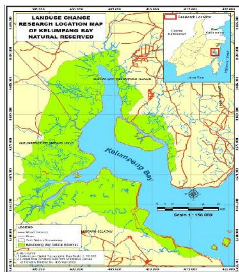
Fig. 1. Research Location Map

The research was conducted for six months from April to September 2013. Data collected consist of primary and secondary data and analyzed with analysis approachment of Analytical Hierarchy Process (AHP) with the number of questionnaires was 30. Through the hierarchy, a complex and unstructured problems can be broken down into groups which are then organized into a hierarchical form. Location of the study can be seen in Figure 1. Analytical Hierarchy Process (AHP) is a functional hierarchy with the main inputs is human perception (Fig. 2).