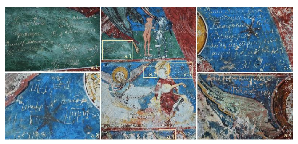
Fig. 4. The Church of the Humor Monastery: a (a.1- a.4). Details with incised messages on the external fresco of the church

A very common form of vandalism is manifested by incised messages, scratches, writings made with different instruments desiring in this way to communicate with the divinity and/or a possible public. In Orthodox Christian cult this sort of message can be frequently found on the walls of churches (figure 4).