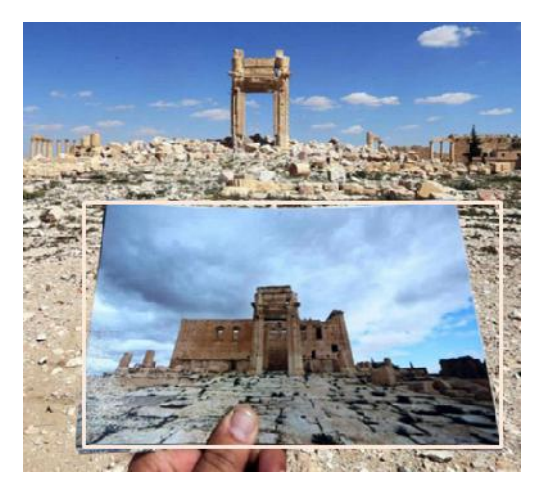
Fig. 3. Temple of Baal, Palmyra, Syria: before and after the ISIL attacks