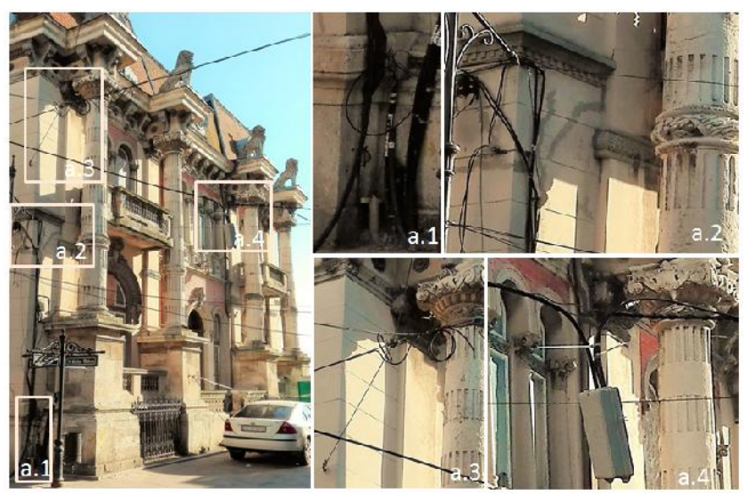
Fig. 7. House with Lions (1898), Constanta: a.1, a.2, a.3 and a.4 - Details of mounted cables from different service providers

A good example in this sense we can find at the historical monuments burdened with cables and installations from different providers (electricity, gas, telephone, internet, etc.), still active on the market or not.