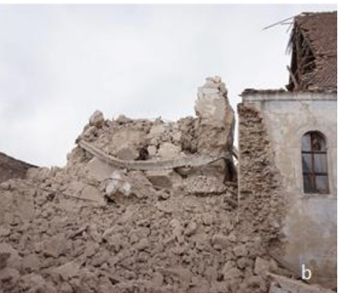
Fig. 8. The Tower of the Evangelical Fortified Church, Rotbav, Brasov: a. The church tower before collapse; b. The church tower after collapse