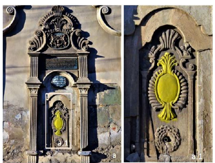
Fig. 5. Fountain at the entrance of the Church of Saint Spyridon , Ia i (1754): a, a.1. Details with decorative elements covered with yellow paint

In this case we encounter a spontaneous manifestation, by virtue of impulse, or premeditated that sometimes may even take the form of a protest so expressed.