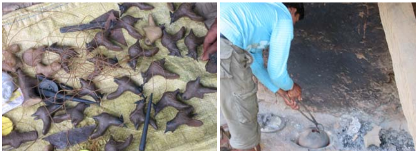
Fig. 3. Wax items under semi-construction and the dhokra metals melted in the fire pit.

The wood is purchased and placed on fire pit (salo – Fig. 3). Two larger or three smaller forms are placed carefully the metal facing down, when the fire is kindled. The wood pieces catch fire. The flames turn yellow when the wax melts and burn away. The lost wax these leaves a hollow form behind into which the metal can later flow. The hard blower machine is used for increasing heat. Upper portion of clay shared placed on the top of the over to prevent the heat from escaping too quickly. It takes over to one and half hour to complete the burning when a light smoke rises and the flames turns green. It is ready to be cast using long pincher the glowing form is clasped at its upper and pulled from the fire pit and laid down on to the clay ground. Then the crucible end with the pitcher tilted up for the casting. The glowing form is cautiously and calmly laid down on to the clay ground. It is astonishing how the melting metal easily flows through quite a number of corners through the pressure of the casting head. The forms are placed upside down against a wall. After cool down b the casting coat is carefully broken and some extra rough bits retained during casting. It is bough carefully and rubberier with sand to get smooth glaze.