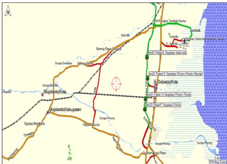
Fig. 1. Four Point Research Sites on the highway Waru - Sidoarjo, East Java, Indonesia

The main highway Waru-Sidoarjo in East Java Province is located more than 49 km in length (Fig. 1).