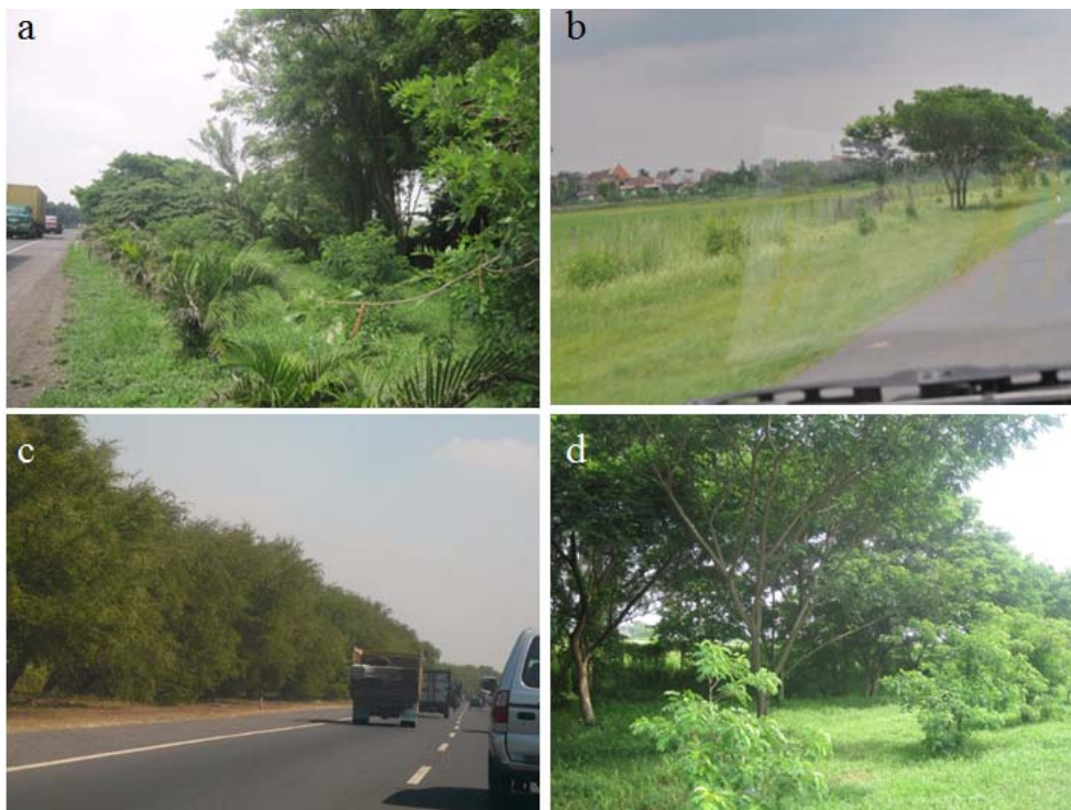
Fig. 2. Research areas for each vegetation composition: a – composition A at Km 27, b – composition B at Km 23, c – composition C at Km 33, d - composition D at Km 31

The study was conducted at 4 point locations with different compositions: composition A, composition B, composition C and composition D. Composition A is located at km 27 the tree-shrubs-bushes (1-1-1), composition B is located at km 23 was without vegetation (0-0-0), composition C was located at km 33 the tree only (1-0-0) and composition D is located at km 31 the tree-shrubs (1-1-0), as shown in figure 2.