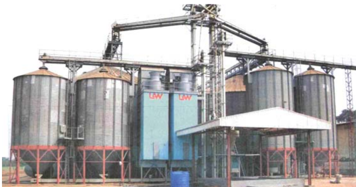
Fig. 1. Silos of the National Strategic Grain Reserve Complex

In addition to seed genebanks, there are also Strategic Grains Reserve Complexes and Community Seed Banks in Nigeria. Figures 1 and 2 illustrate the Strategic Grains Reserve Complexes and their locations in Nigeria. The existing Strategic Grains Reserve Complex in Nigeria has a storage capacity of 325,000 tons of grains.