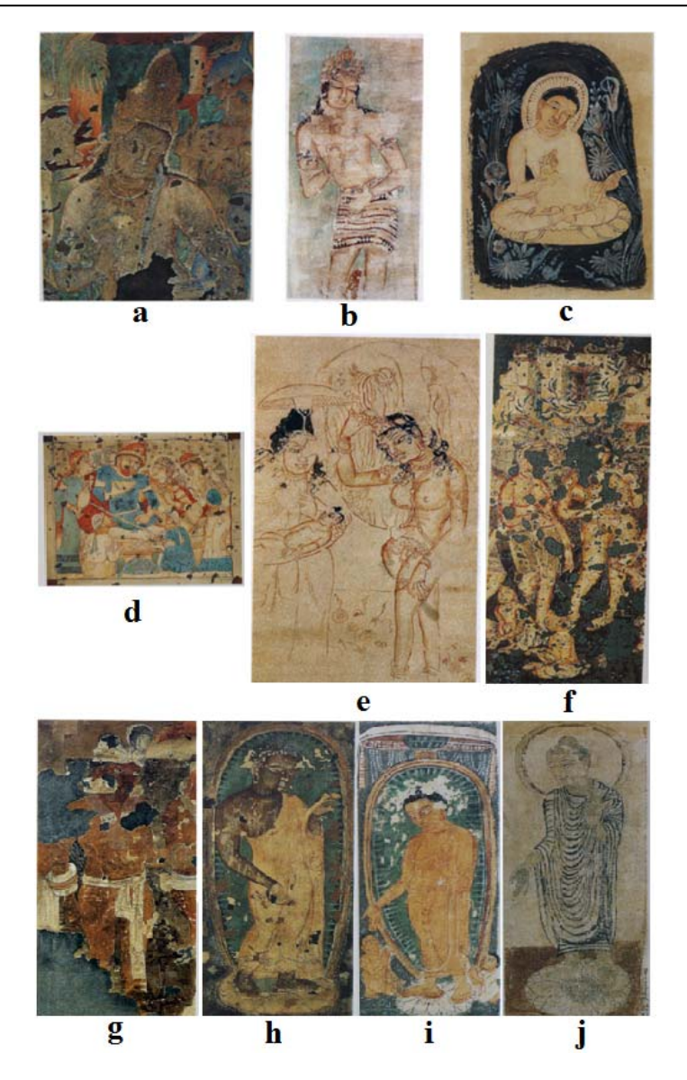
Fig. 1. Paintings of a Japanese artist (1916): a – Cave 1 Buddha wood print, b – Cave 1 Standing Buddha, c – Cave 1 Great Miracle; d – Cave 1 Ceiling decoration; e – Cave 2 Jataka Notes, f – Cave 2 LHS Wall; g – Cave 10 King Procession; h, i and j – Cave 10 Standing Buddha

Finally, the surface was gently pressed down with a spatula. For fixing detached patches of paintings, L. Cecconi used the following methods: