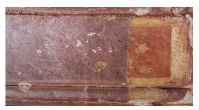
Fig. 4. Partly cleaned painted surface of cave no 17, pilaster of Ajanta

During the course of works, it was also noticed that the solvents recommended after long experimentation for the removal of soot are being absorbed by the painted surface at a very high rate. As such absorption of organic chemicals is not advisable in the long run and it may probably be one of the reasons for the frequent appearance of chalkiness on the paintings, necessary corrective measures were taken in that regard for scientific cleaning works at Ajanta. The partly cleaned painted surface of cave no. 17, at pilaster of Ajanta, is shown in Figure 4.