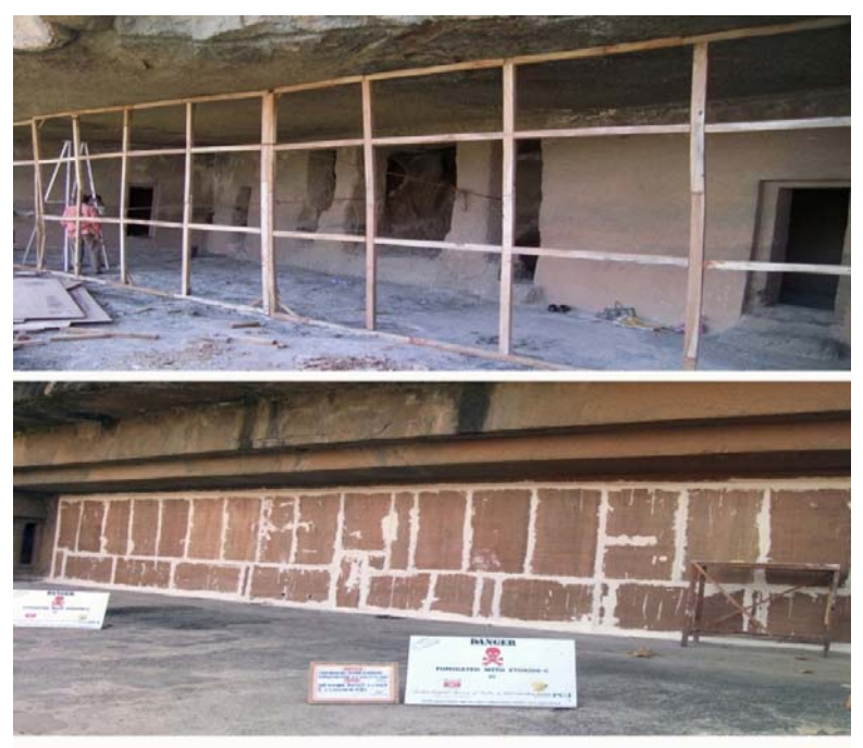
Fig. 3. Showing the fumigation of the Ajanta Caves

in Feb/March 1998. Therefore, regular spraying of pyrethrum was being carried out on the unpainted part of the cave, along with the path ways at Ajanta (Fig. 3).