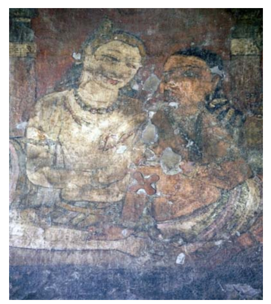
Fig. 2. Painted figure with Copper Nails, Cave No. 17

Major structural conservation measures, in the form of improvement of drainage and other protective measures were also executed during that period. Five drains to cope up with a run off of 4 inches per hour of rain water, with a slope to develop a velocity of 4 to 6 ft per second were constructed on the top of the cave. A zinc drain was also inserted in the inner aisle of cave no 1 to drain out water from the important paintings of Padmpani & Vajrpani.