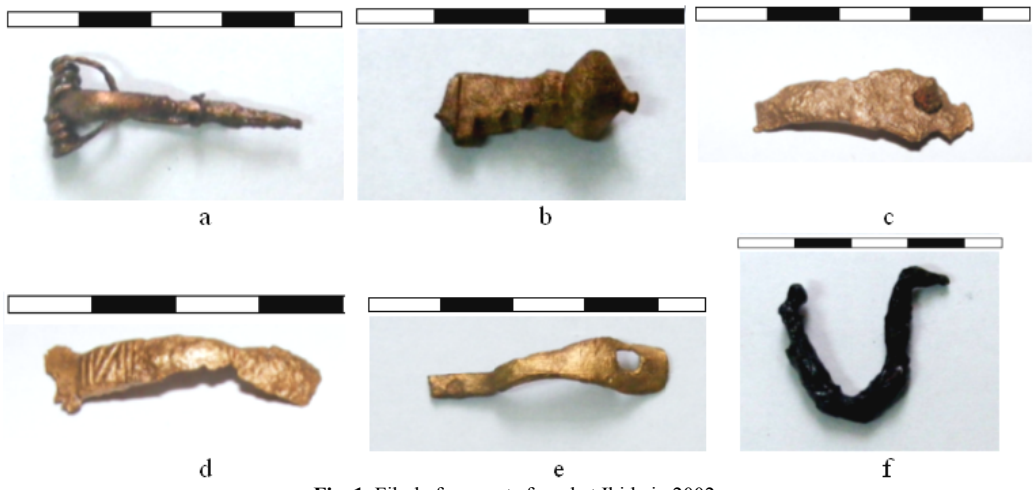
Fig. 1. Fibula fragments found at Ibida in 2002: a - F1; b - F2; c - F3; d - F4; e - F5; f - F6.

- Fibula fragment - F6 (Fig. 1f), discovered in the same place, year and area as the ones above, but -0.35 m underground and in square 10. Its inventory number is 45848 and it is in a poor state of preservation. It is a fragment consisting only of a loop from the fibula body and a small part of the bottom. The exaggerated arching of the loop apparently happened after its disposal. The item was found in the soil used as filling for the tomb, a fact indicating an origin prior to that of the items above. The measurements for the item are: 21.70 mm for the amplitude of the loop, 15.40 mm for its opening and a weight of 3.76 g.