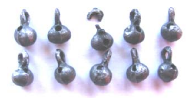
Fig. 2. Buttons B2 found in 2006 at Ibida

The objects were analyzed by EDX and micro-FTIR techniques without sampling