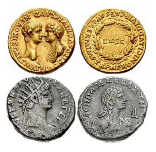
Fig 10. The coins mentioned in the New Testament [14]