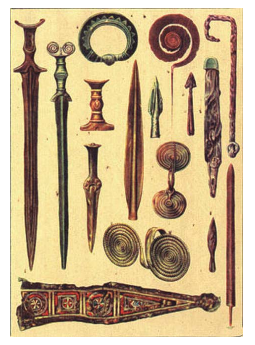
Fig. 3. Weapons from the Bronze Age, Romania [13]

The European territory, rich in natural resources, is characterized by the presence of many treasures made of precious metals and stones and metal weapons (Fig. 3) [11-15].