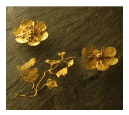
Fig. 4. The funerary diadem displayed at the Louvre Museum [13].

The European territory, rich in natural resources, is characterized by the presence of many treasures made of precious metals and stones and metal weapons (Fig. 3) [11-15].