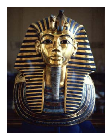
Fig. 2. Tutankhamen's mask [12]