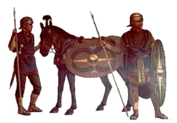
Fig 11. Roman soldiers with war equipment [15]

In the year 27 B.C., Augustus instituted new elite troops - the Praetorian Guards – with the exclusive mission to defend the emperor. At the beginning, they were nine cohorts, out of which three stayed in Rome and the others in the nearby cities. Later, the cohorts increased to twelve. The Praetorian uniform was similar to that of other legions (Fig. 11), excerpt for the helmet which was gold coated and had the imperial eagle on it (Fig. 12).