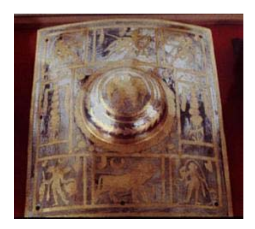
Fig. 13. Roman schield [13]