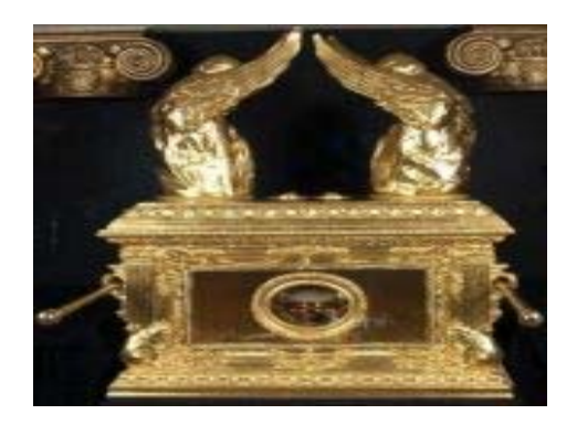
Fig 8. The Ark of the Covenant (in the Capernaum synagogue, 4th - 3rd century B.C.)[12].

During the exodus, the tent was a holy place for the Hebrew people (Exodus 33, 11). Its appearance and dimensions are mentioned in detail where Yahweh advises Moses to built it (Exodus 26) and where its building by the two skillful masters, Betaleel and Oboliah, is described (Exodus 36, 8-38). The most important objects are the altar of incensing, the candelabrum with seven arms (Menorah- Fig. 9), the table for offerings, the Ark of the Covenant, the copper snake etc.