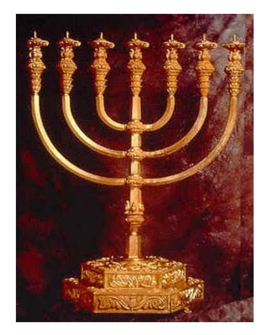
Fig 9. The candelabrum with seven arms - Menorah [12]

The New Testament mentions the following objects: