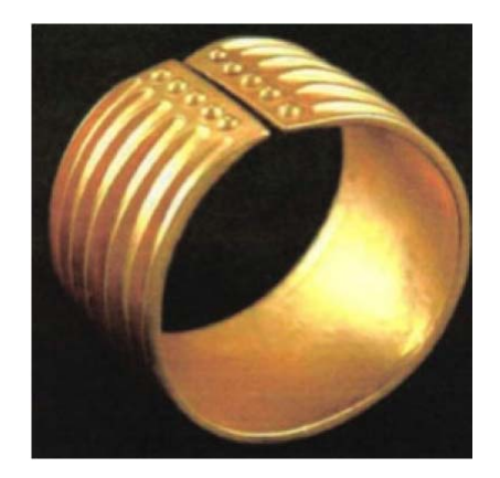
Fig. 7. Golden cuff bracelet – The treasure is stored in The National History Museum from Bucharest [12]