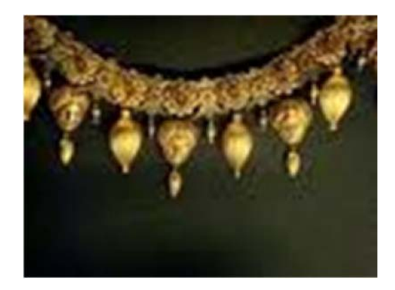
Fig. 5. Gold necklace [14]

The Etruscans, the first inhabitants of Italic peninsula, were also interested in jewels. The Kings appeared in the ceremonies as supreme priests, wearing gold crowns, precious footwear, mantles richly embroidered and decorated with human faces, and they sat on sumptuous thrones during trials and gatherings. During ceremonies dedicated to military victories, the King wore a scarlet toga, embroidered in gold, a golden crown, a sphere and a golden chain, and in the hand an ivory scepter with an eagle at its top.