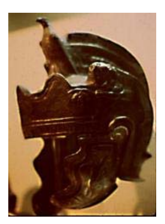
Fig 12 . The Praetorian helmet with the imperial eagle [13]