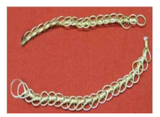
Fig. 6. Golden bracelets [14]

The Etruscans, the first inhabitants of Italic peninsula, were also interested in jewels. The Kings appeared in the ceremonies as supreme priests, wearing gold crowns, precious footwear, mantles richly embroidered and decorated with human faces, and they sat on sumptuous thrones during trials and gatherings. During ceremonies dedicated to military victories, the King wore a scarlet toga, embroidered in gold, a golden crown, a sphere and a golden chain, and in the hand an ivory scepter with an eagle at its top.